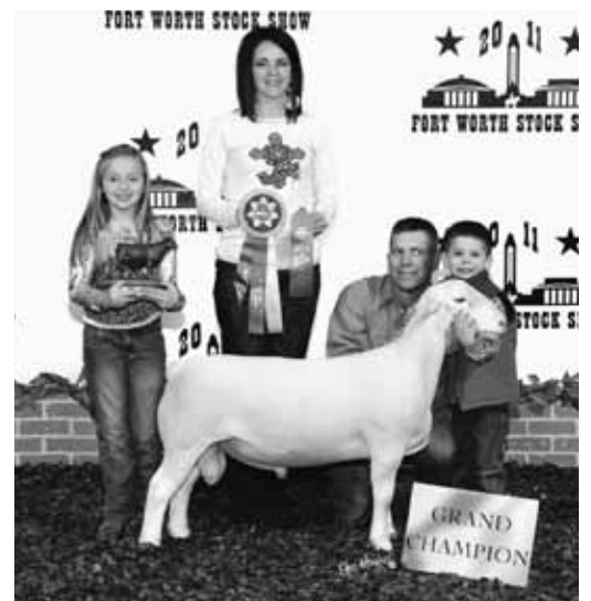
2011 National Champion White Dorper Ram and Reserve Supreme Ram~Fort Worth, TX. Ram lambs out of this ram, "Killer", are here and will be available later this spring.

Proverbs 16:3 ~ "Commit to the Lord whatever you do, and your plans will succeed."